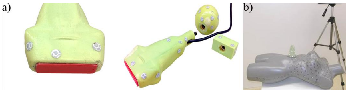
Figure 2. a) Prototype of a USG probe, b) Test system (Buń et. al 2015)

After a prototype of an immersive system was built, the influence of additional removable elements on object recognition by the tracking system was studied. It was observed that they increased the ability of the tracking system to recognize objects, especially when the user covered a more sizable portion of the gripping part of a USG probe with his hand. The results of the study are presented in Figure 3 .