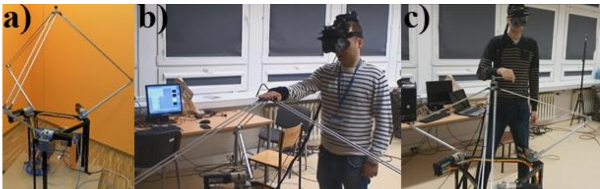
Figure 4. (a) Delta robot, (b) robot's end effector representing the surface of the virtual object, (c) immersive and haptic simulation of the manual assembly (Grajewski et al. 2015)

technologies. Initially, the principal task of the robot was to move the arm to a position in which the operator's arm could touch it in order to simulate an encounter with an object in VR space. The authors added a special algorithm of positioning the end-effector of the delta robot against the tracked object, i.e. a user's hand. In order to simulate the operation of manual assembly, it was decided to modify the end-effector by adding a small DC motor with a gearshift, as well as an encoder, in order to simulate real resistance that may be sensed by the user while turning a screw into the cylinder block of the motor (Figure 4c).