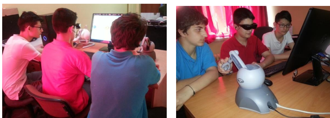
Figure 2. Some Students from Experimental Group Using Haptic Devices.

questions were decided upon in accordance with opinions drawn from a board of experts. It was paid heed to create explicit and purposeful survey items. Both groups were surveyed. While the first group answered questions regarding the effects of a haptics augmented simulation on their attitude towards Physics, the second survey consisted of questions regarding the effect of traditional teaching on students' beliefs.