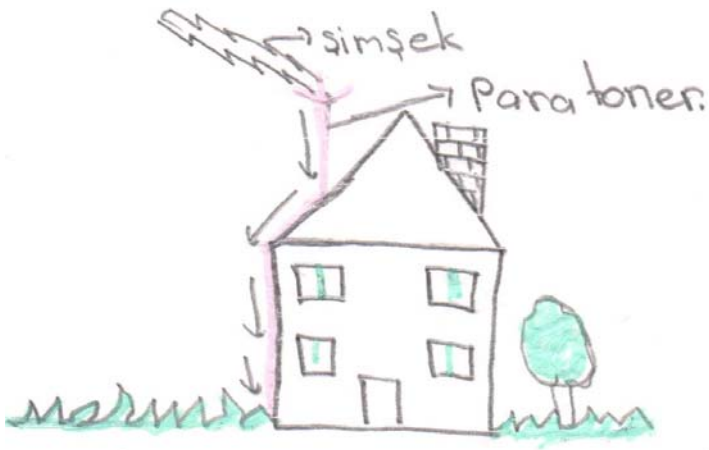
Figure 1. A student's lightning rod drawing